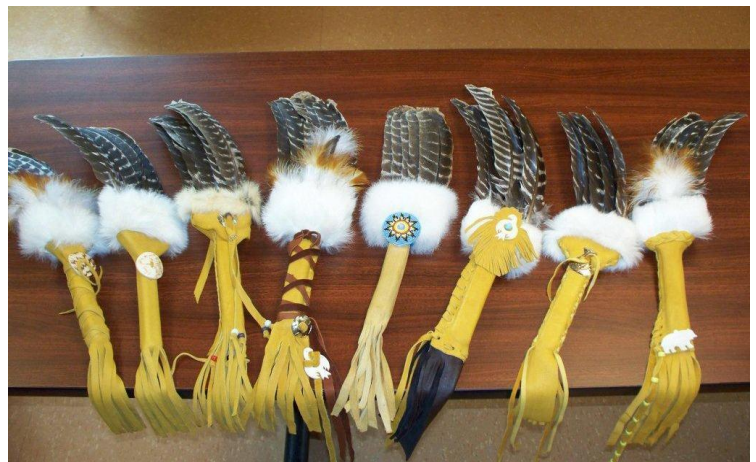
This is a picture of the group's feather fans.

“Most useful was, cost value of time & materials to be able to finish product conducive to what I might be able to sell product.”