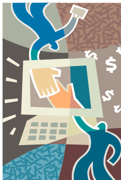
"What an eye opener" Comment from a Centra partici-